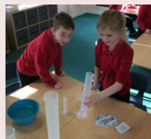
YR 4 UPDATE