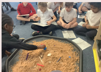
YR 3 UPDATE

In RE Year 1/ 2 have been learning about the story of Moses and talking about why he is significant to Jewish people. The children especially loved making their own Moses baskets.