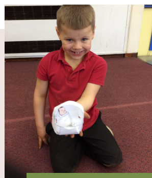
YR 1/2 UPDATE