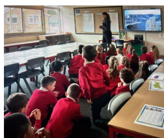
Class Cedar setting off for Europe!