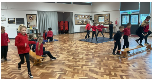
Year 3 4 PE—“Circuits!”