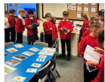
Class Pine exploring France!