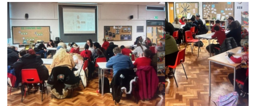
Year 6 Partnership Afternoon