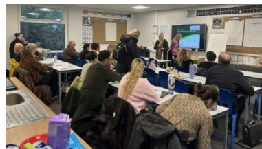
Staff Professional Learning