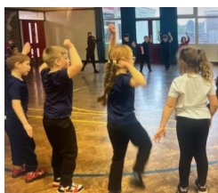
Year 2 Dance!