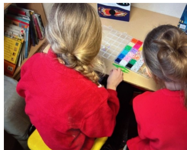
Nurture Lunchtime Session