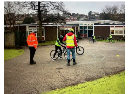
Year 5 / 6 Bikeability Training