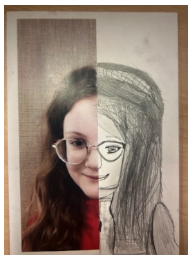
Great self portraits in Year 3/4 at our Parent Partnership Afternoon.